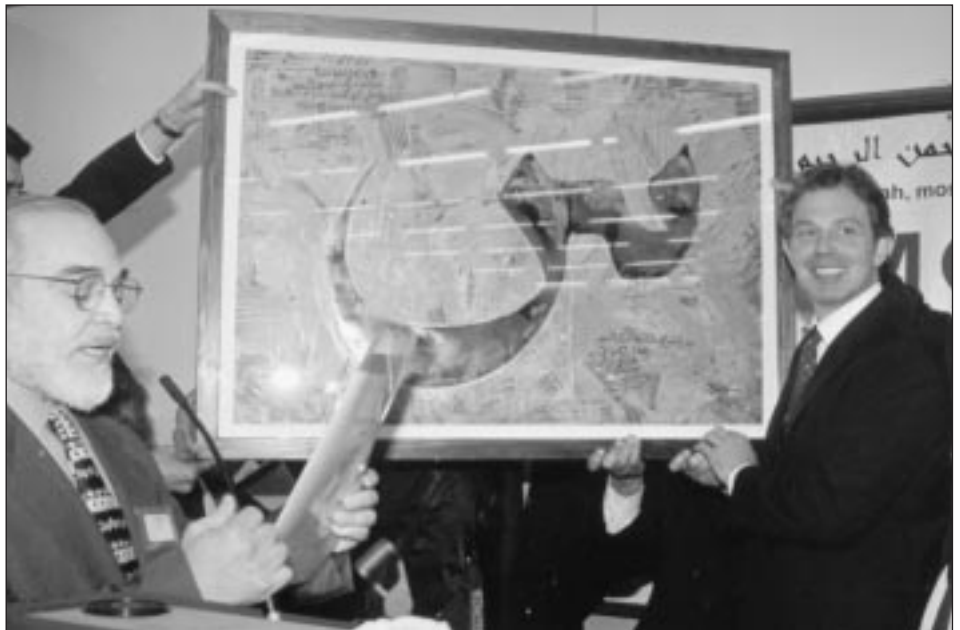
Presentation of Islamic calligraphy to the Prime Minister

The Prime Minister, Tony Blair, was presented with an exquisite piece of artwork painted by the renowned Ali Omar Ermes when he attended a reception for UK Muslims organised by the MCB on Wednesday 5th May 1999. The painting of the letter "seen" has been worked on for over 20 years, it is an extremely valuable piece and shall hang in Downing Street once framing is completed.