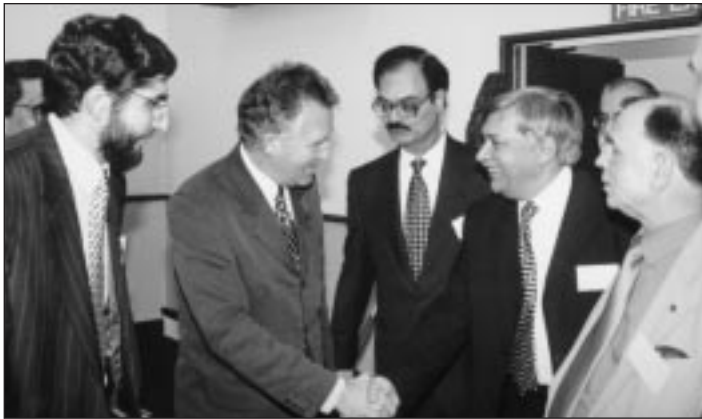
Mr Hain being introduced to MCB members

Peter Hain MP, the newly appointed Foreign Office minister was the chief guest at a Reception organised by the MCB at the Commonwealth Institute on November 4th, 1999. The reception was attended by a cross section of the Muslim community, senior members from Government departments and prominent Muslim politicians and community leaders. (A detailed report will appear in the next issue of the newsletter insha Allah ).