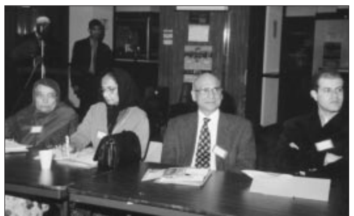
A view of delegates at the business session

English and he ended with a spirited call that he would 'go on strike outside Pebble Mill' if this were necessary to bring about a change in the BBC on Muslim issues. Both speakers noted the significant impact that the MCB had made in public circles in a short period.