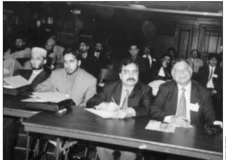
Public session of the AGM

Lord Nazir Ahmed identified several issues that warrant concerted effort, particularly the problem of youth alienation. He stressed the need for Imams in the UK to have the ability to communicate in