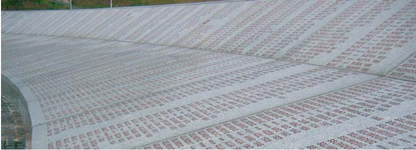
A section of the Memorial wall with the names of near 8000 Soudanese slaughtered in Srebrenica